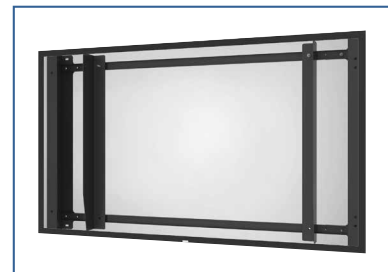
Landscape Orientation Available (EWL-OH55F)