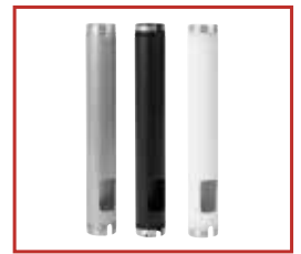
Available in silver, black or white to match displays, projectors and ceiling mount surfaces