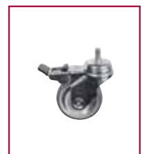
Accessory Caster (ACC332)