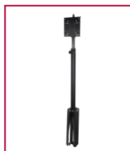
Collapsible design for easy transportation