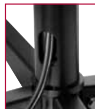
Internal cable management