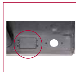
Removeable outlet receptacle