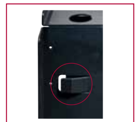
Stud locating tabs