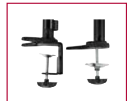
Desk clamp and grommet mount option

■ DESK ASSEMBLY For wood or composite surfaces up to 3" (76mm) thick