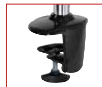
LCT620AD's Clamp on base easily clamps to edge desk or counter top