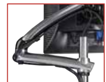
Cable management keeps a clean appearance