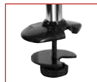
LCT620AD-G's Grommet base works with through holes in the desk or counter top