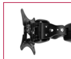
Quick release mechanism