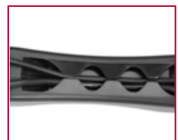
Internal cable management