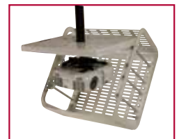
Maintenance Free Hook-n-Hang Feature

PROJECTOR SAFETY All-steel construction for durable protection