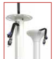
Internal cable management