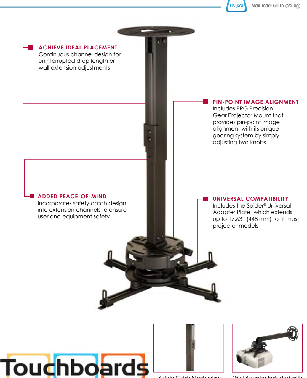
Safety Catch Mechanism

Peerless has packaged flexibility and ease together in one box with these ceiling/wall mounting kits, which enable the installation of a projector from either the ceiling or the wall. This all-inone kit includes the industry's first precision gear projector mount that delivers precision image alignment with a simple turn of a knob. These comprehensive projector mounting kits also include an adjustable length column that provides ideal height positioning for the perfect projector installation. Concealed within the column is a cable-management channel, assuring a clean and clutter-free appearance.