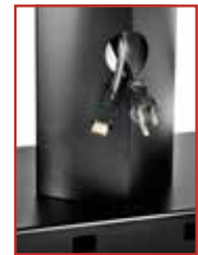
Integrated cable management

*Antimicrobial protection is limited to the treated article and does not protect a user against disease causing bacteria. Always clean products thoroughly after each use. Visit agion-tech.com for more details.