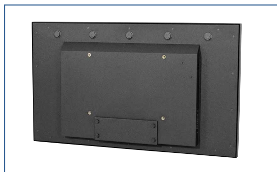
Sealed cable entry helps prevent water and debris from getting inside