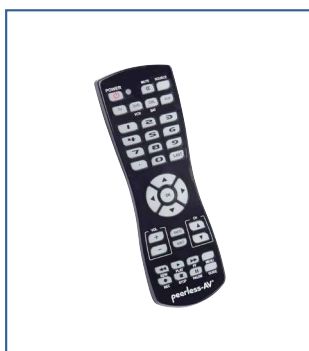
Waterproof Universal Remote

IPS PANEL Provides exceptional picture quality from any angle