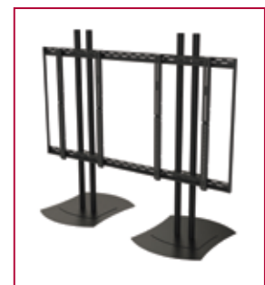
2x2 Video Wall Stand