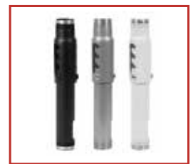
Available in black, silver or white to match displays, projectors and ceiling mount surfaces