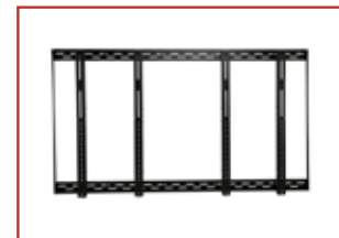
2x2 Mounting Kit

UNIVERSAL ADAPTOR RAILS Horizontal adjustment makes mounting and aligning displays quick and easy