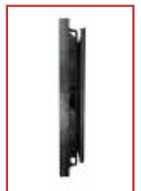
Profile with display attached

* Please check compatibility formula with your display dimensions.