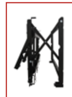
Full-service quick release access

ADJUSTABLE CARRIAGE EXTENSION FORCE Adjustable to the weight of the display, allowing the quick release to activate with gentle force