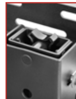
Tool-less micro adjustments