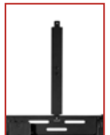
Wall plate spacers (sold separately)