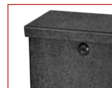
Includes cam lock to secure internal components