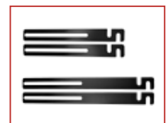
Adjustable mounting brackets easily attach the enclosure to virtually any Peerless-AV® mount or flat surface