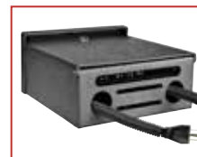
Cable management portals for a clean, clutter free installation