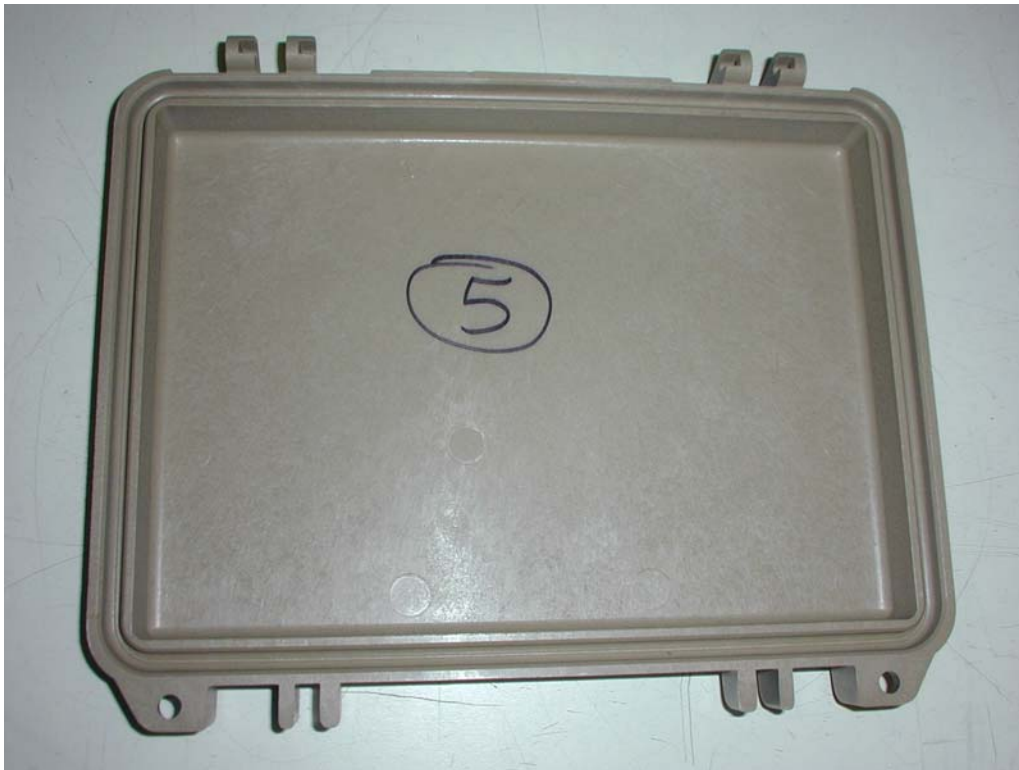
Photograph 4-6: Tan Plastic Sample upon completion of the incubation period