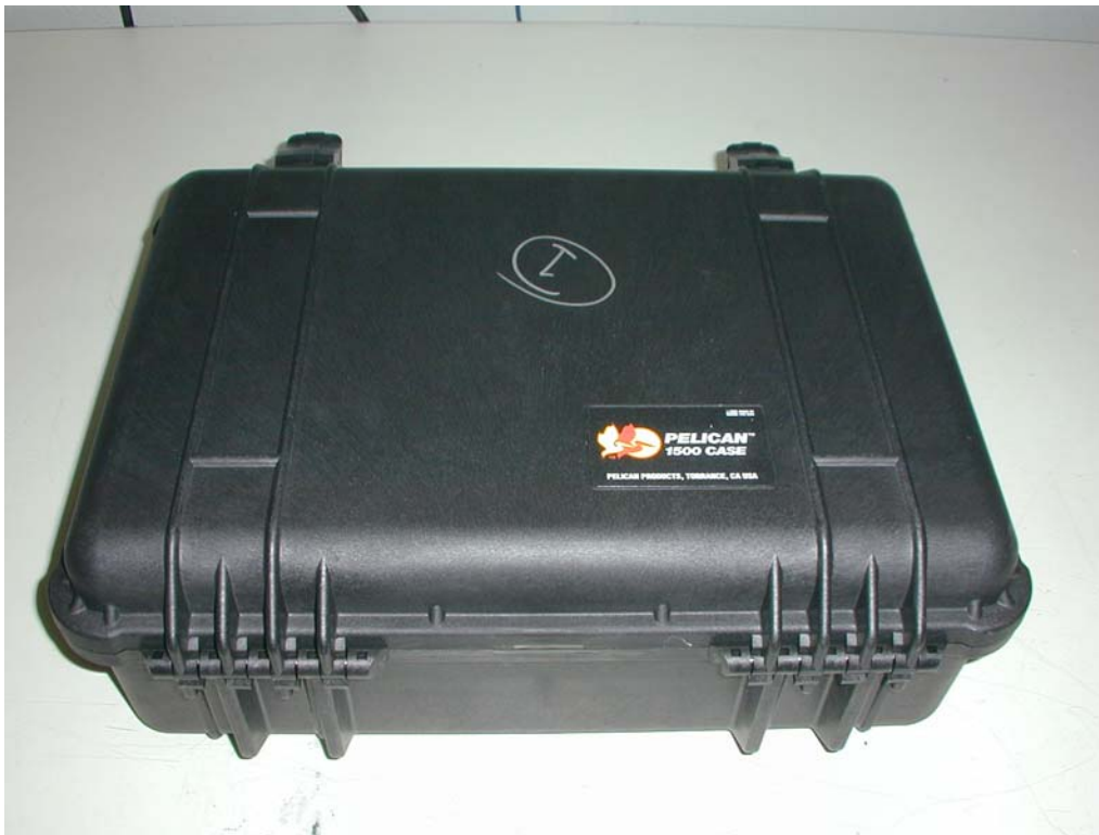
Photograph 4-2: Case upon completion of the incubation period