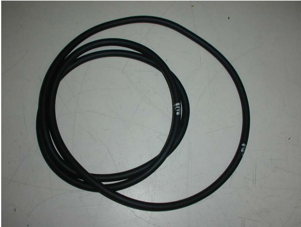
Photograph 4-7: Gasket upon completion of the incubation period