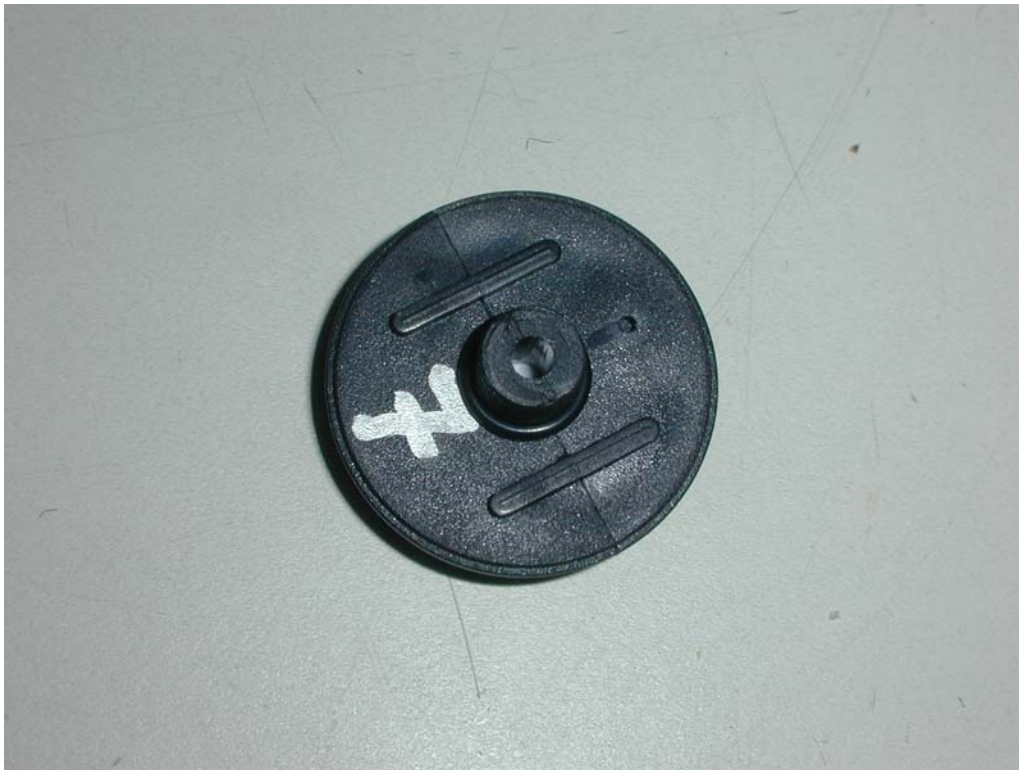
Photograph 4-8: Vent upon completion of the incubation period