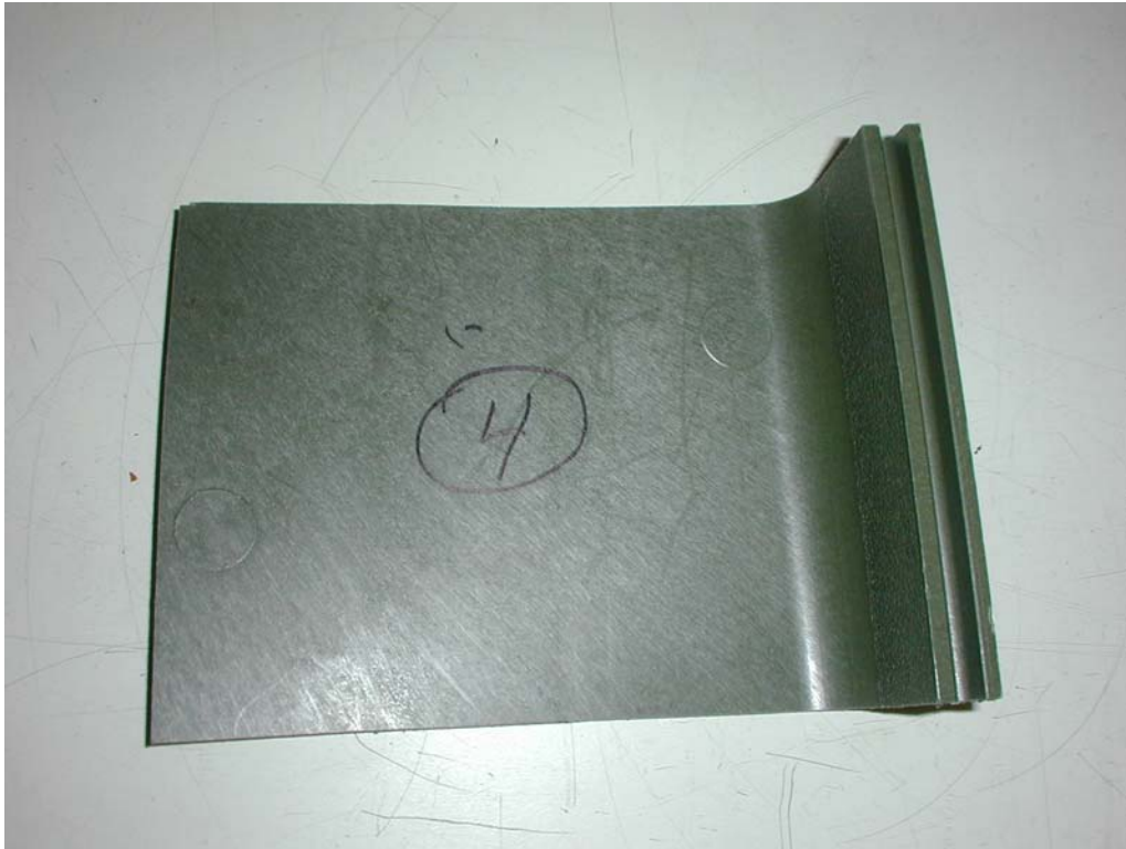
Photograph 4-5: Green Plastic Sample upon completion of the incubation period