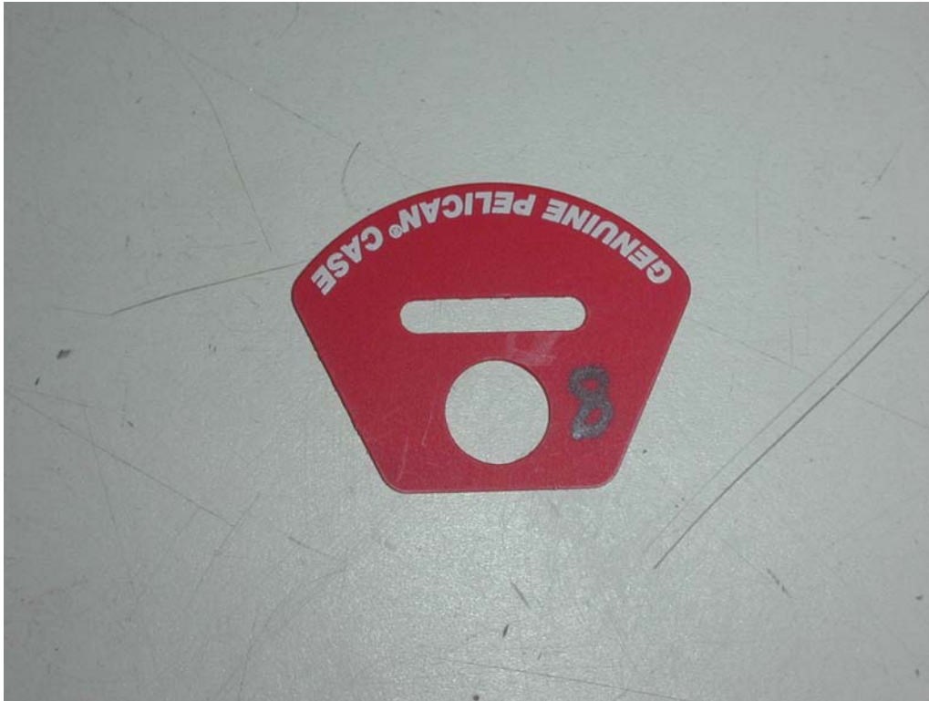
Photograph 4-9: Red Label upon completion of the incubation period