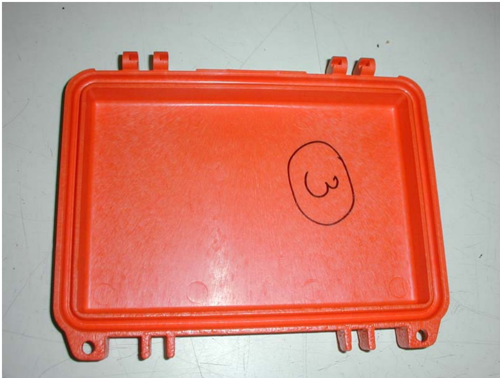
Photograph 4-4: Orange Plastic Sample upon completion of the incubation period