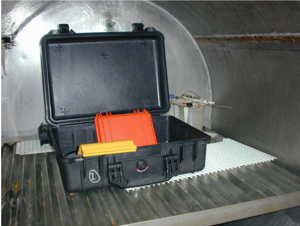
Photograph 4-1: Test units in the chamber prior to inoculation