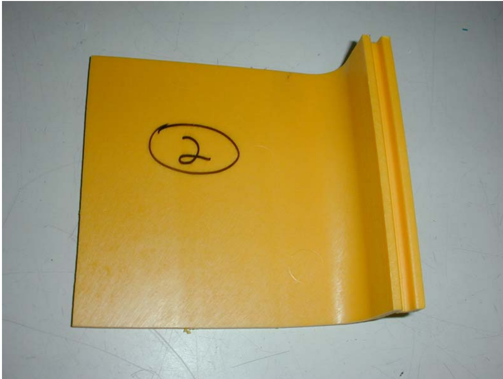
Photograph 4-3: Yellow Plastic Sample upon completion of the incubation period