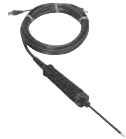
Sniffer probe LP 505