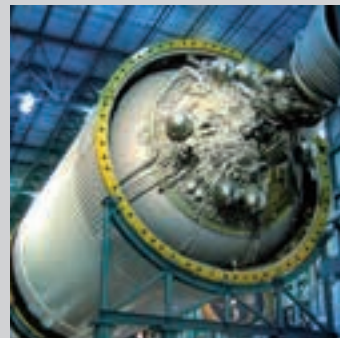
Research & Development