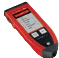
Remote control RC 10

As an extension range, the ASM 340 exists also without a backing pump. This ASM 340 I allows to connect a different backing pump, for even more convenience and/or better adaptation to customer application, as for example in case of integration into a leak detection system. The connection for the external backing pump is located at the rear of the leak detector.