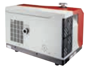
ASM 340 I