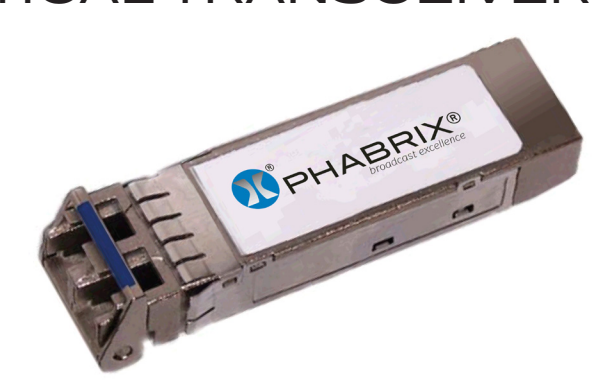
1550nm Optical Transceiver SFP Module