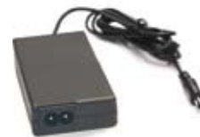
Carry case and AC power supply as standard