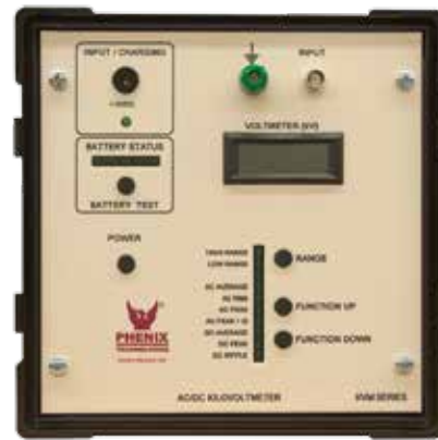
Metering Head for Models KVM50A, KVM100A and KVM200A