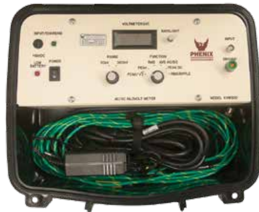
Metering Head for Model KVM300A