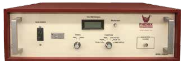
19" Rack Mount Metering Head