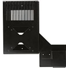
Figure 2: V-Series Bracket