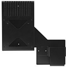
Figure 1: S-Series Bracket