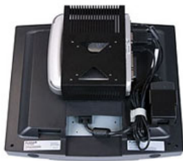
Figure 3: Fully integrated unit