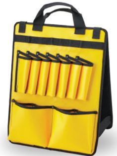
B321 Pallet included with B320 Backpack