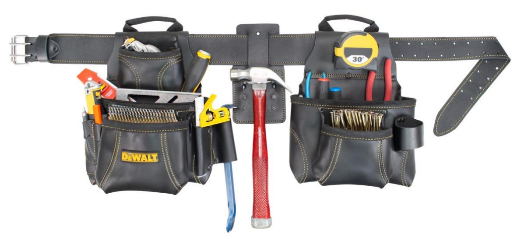
Photographed as displayed