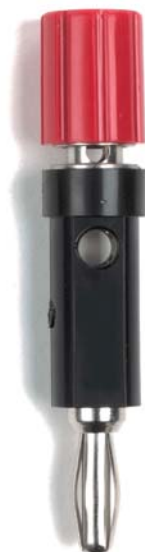
Model 2894 Binding Post to Single Banana Plug