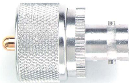
Model 3286 Adapter, BNC (Female) to UHF (Male)