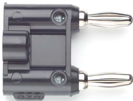
Model MDP, 4892, 4898 Stackable Double Banana Plug with Cable Guide