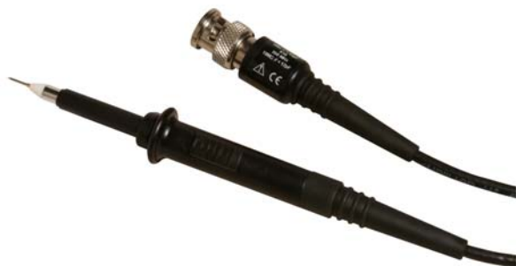
Model 6497 Modular Passive Oscilloscope Probe with Readout Actuator