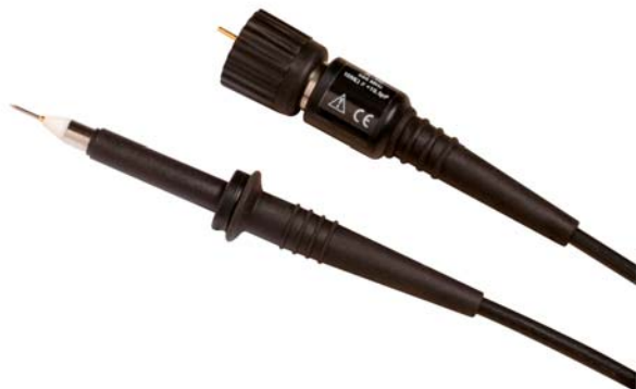
Model 6551 Microline Passive Oscilloscope Probe with Readout Actuator