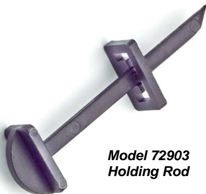
Model 72903 Holding Rod