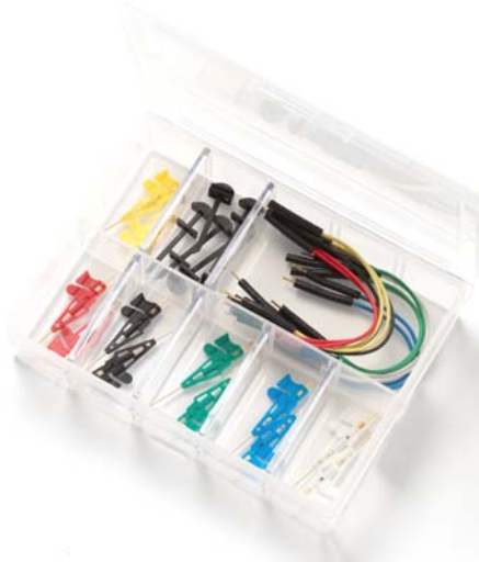
Model 72902 Micro SMD Grabber Test Clips Kit