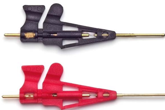
Model 72902-0 & 72902-2 Micro SMD Grabber Test Clips

Model: 72902 (Kit pictured on page 1) Model: 72902-* (Grabber pictured on the right) (*=Color, Available Colors: -0 (Black), -2 (Red)) Model: 72903 (Holding Rods on page 1, sold 10 per package)