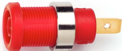
Model 72913 Panel Mount IEC61010 4mm (0.16in) Jack for Sheathed Banana Plugs

Panel Mt IEC61010 4mm (0.16in) Jack for Sheathed Banana Plugs