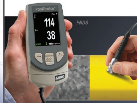
Duplex Probe measures individual layer thicknesses of zinc and paint in a duplex coating system

All Regular Cabled Probes are suitable for underwater use