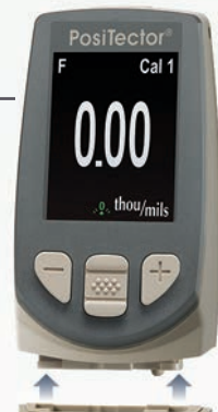
Integral Probe Style