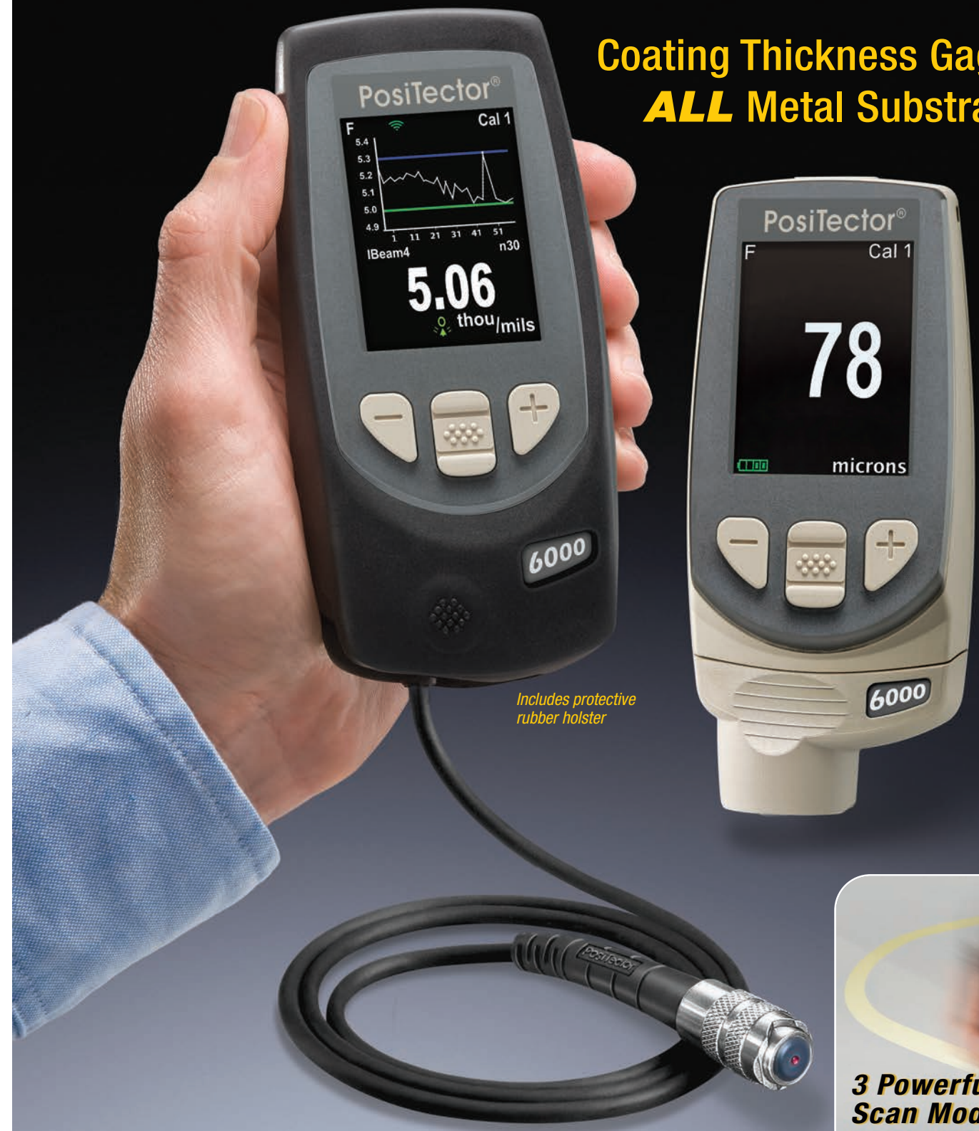
Includes protective rubber holster

Coating Thickness Gages for ALL Metal Substrates