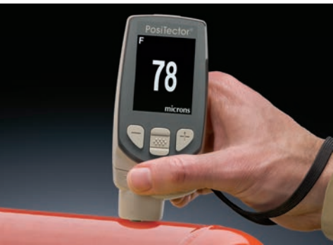
For measuring paint, powder, etc. on all metals...