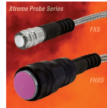
Xtreme Probes with Alumina wear faces and braided cables for hot/rough surfaces