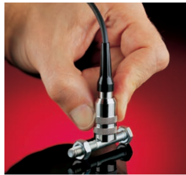
...and for measuring galvanizing, plating, anodizing and more.