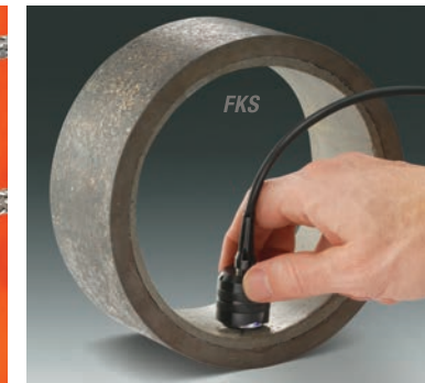
Thick Probes series for thick protective coatings: epoxy, rubber, fireproofing and more