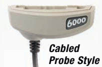
Cabled Probe Style