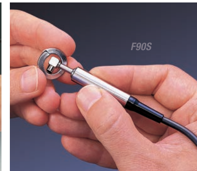
Microprobe series for small parts and hard-to-reach areas