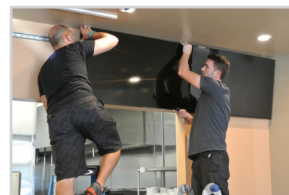
Allows video walls and digital displays to be positioned flat or up to 15 degrees