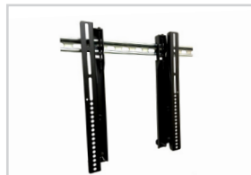
Installation safely secures digital signage in place