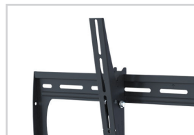
Holds displays less than 2" from the wall with 10° of downward tilt