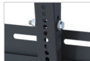
Made with corrosion-resistant materials and super durable powder coat for protection in outdoor environments