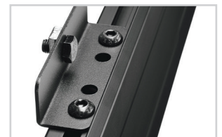
L-brackets can be moved anywhere along interface bar to match stud location