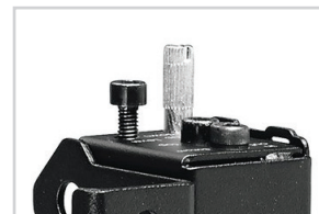
Easy to install display brackets with 6-point (x,y,z) adjustments available