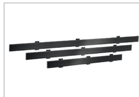
Interface bars are available in multiple lengths