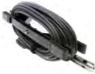
Cable Management Kit