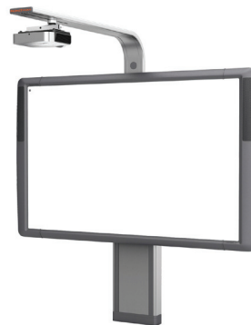
ActivBoard 300 Pro Adjustable with PRM-30a or PRM-35 projector

205 Westwood Ave, Long Branch, NJ 07740 Phone: 866-94 BOARDS (26273) / (732)-222-1511 Fax: (732)-222-7088 | E-mail: sales@touchboards.com