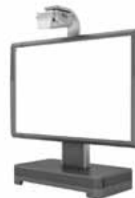
ActivBoard 500 Pro Mobile System with EST-P1 projector