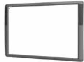
ActivBoard 500 Pro

205 Westwood Ave, Long Branch, NJ 07740 Phone: 866-94 BOARDS (26273) / (732)-222-1511 Fax: (732)-222-7088 | E-mail: sales@touchboards.com