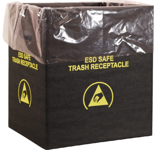
Trash receptacle with liner Receptacle sold separately