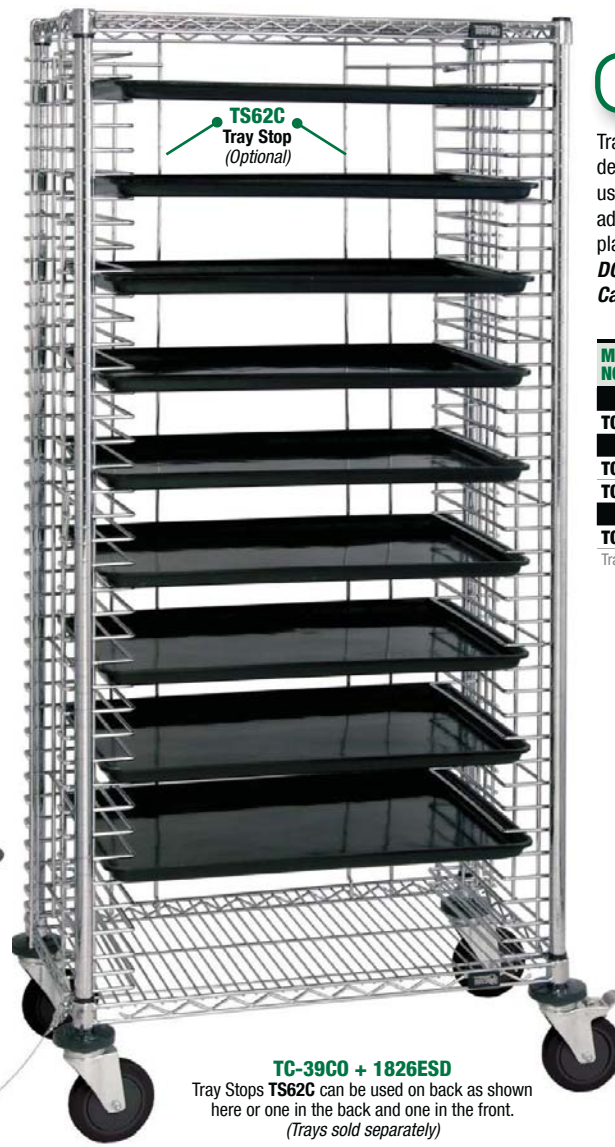
TC-39CO + 1826ESD Tray Stops TS62C can be used on back as shown here or one in the back and one in the front. (Trays sold separately)

CONVERT STANDARD WIRE SHELVING INTO CONDUCTIVE SHELVING WITH THESE ACCESSORIES THAT ARE INCLUDED WITH THESE PACKAGES