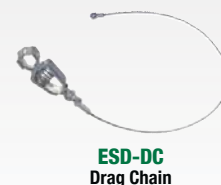
ESD-DC Drag Chain

CONVERT STANDARD WIRE SHELVING INTO CONDUCTIVE SHELVING WITH THESE ACCESSORIES THAT ARE INCLUDED WITH THESE PACKAGES