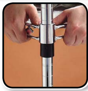
2 Slide shelf over sleeve for secure locking.