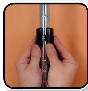
1 Snap plastic sleeve around post.