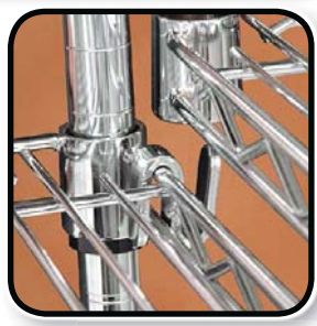
3 Two "S-Hooks" are used to connect add-on wire shelf to starter units.