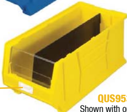
QUS953 Shown with optional divider, window front, adhesive label holder and insert

AL-23 2" x 3-1/2" Adhesive clear label holder and inserts. Package of 24 (Sold separately)