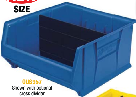
QUS957 Shown with optional cross divider