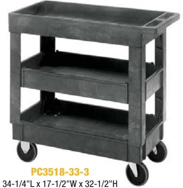
PC3518-33-3 34-1/4"L x 17-1/2"W x 32-1/2"H