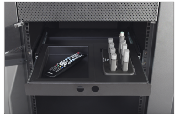
Equipment shown for illustrative purposes only