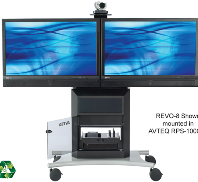
REVO-8 Shown mounted in AVTEQ RPS-1000LE