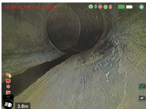
HDR IMAGE & TiltSense™