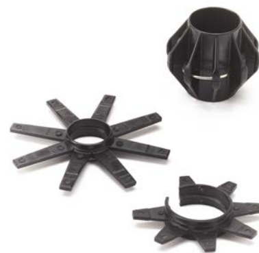
Set of 30 mm Pipe Guides included with SeeSnake Mini reel