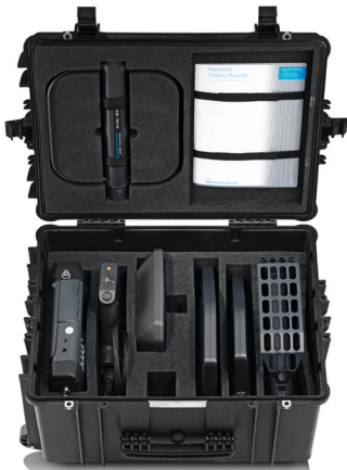
R&S®HE400Z3 transport bag (large).