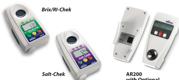
AR200 with Optional Communications Cradle