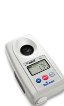
r 2 mini