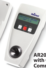
AR200/TS METER-D with Optional Communications Cradle